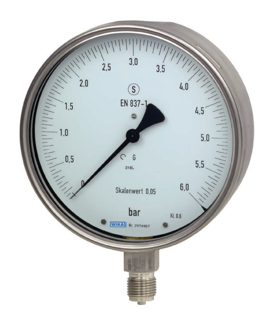
Test gauge series, safety version, model 332.30